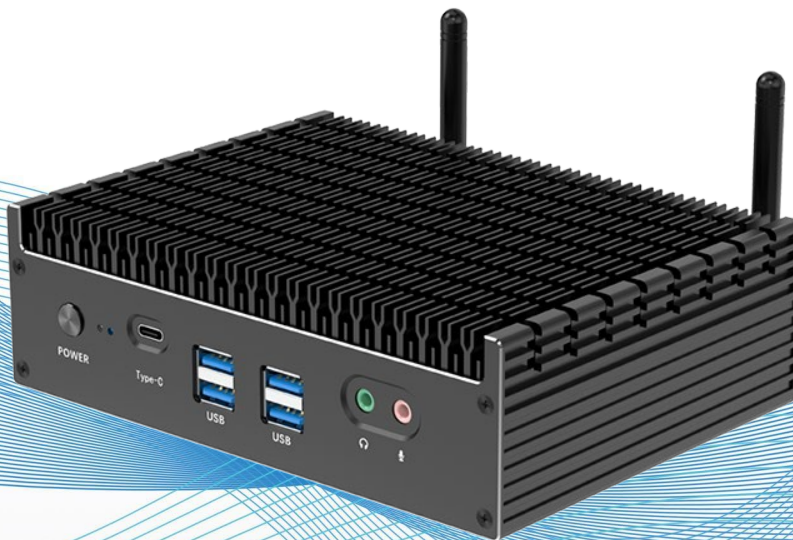
■ Front bezel I/O view

DDR4 SODIMM x2, up to 64GB memory supported, Thunderbolt 4 protocol supported